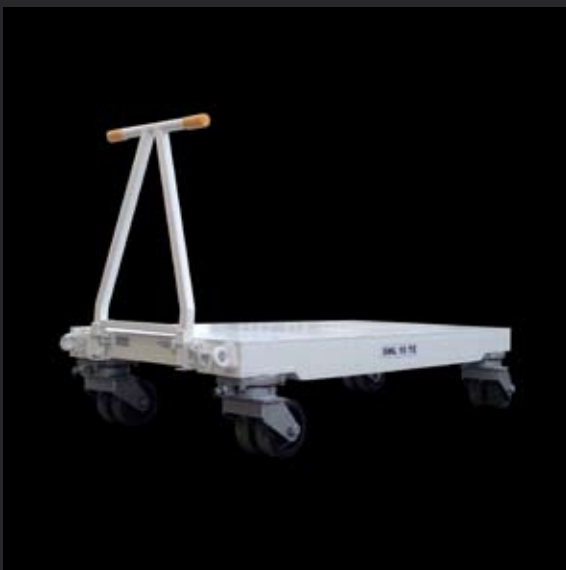
Swivel Castor Trolleys