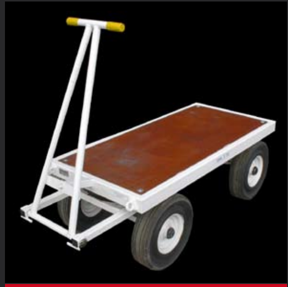
4-Wheel Turntable Trolleys